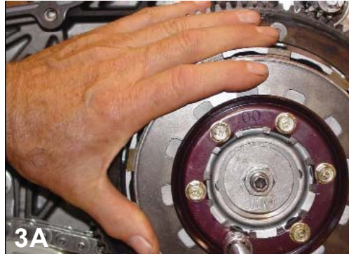
3. A & B - Follow the instructions listed in the service manual and remove the OEM clutch retainer and diaphragm spring