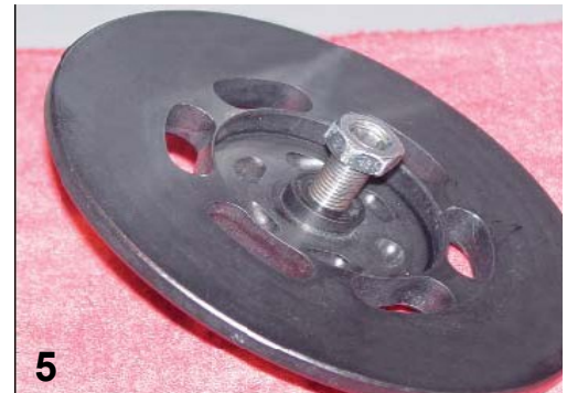
5. Install the OEM clutch adjuster in the Posi Lock Clutch pressure plate. Leave approximately one inch of exposed thread as shown. Place the lower Posi Lock Clutch pressure plate in place of the OEM pressure plate.