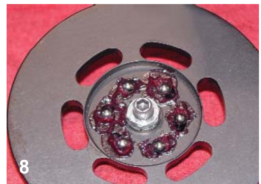
8. Remove the Posi Lock Pressure Plate. Apply a small amount of grease to the 6 ball bearings and place them in the ball grooves.