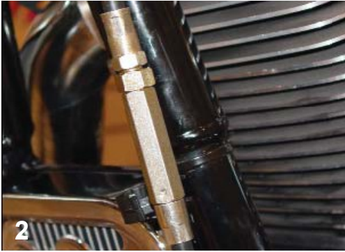
2. Slide back the boot on the clutch cable adjuster and loosen the clutch cable jam nut. Adjust the cable all the way in as shown.

1. Support the motorcycle on a suitable lift. Refer to the service manual, drain the chain case oil and remove the primary cover.