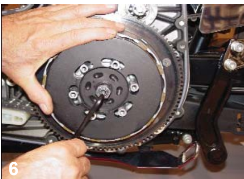
6. Adjust the Posi Lock Clutch by applying firm pressure onto the clutch pack. Using a 7/32 Hex key, turn the adjuster clockwise until you see or feel the Posi Lock Pressure slightly lift. Now back the adjuster counter clockwise 1 to 1-1/2 turns.