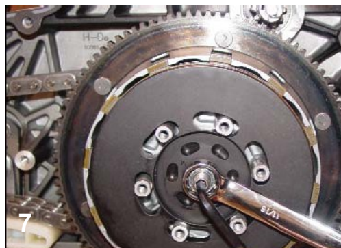
7. Lock the jam nut insuring you do not move the adjuster. NOTE: This is a critical adjustment and must be made accurately for the Posi Lock Clutch to work properly.