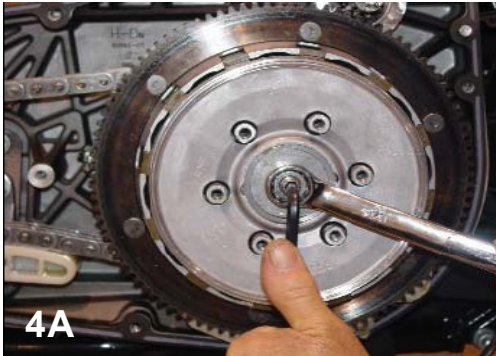
4. A & B - Remove the OEM jam nut and clutch adjuster from the stock pressure plate. They will be re used. Remove the OEM pressure plate.