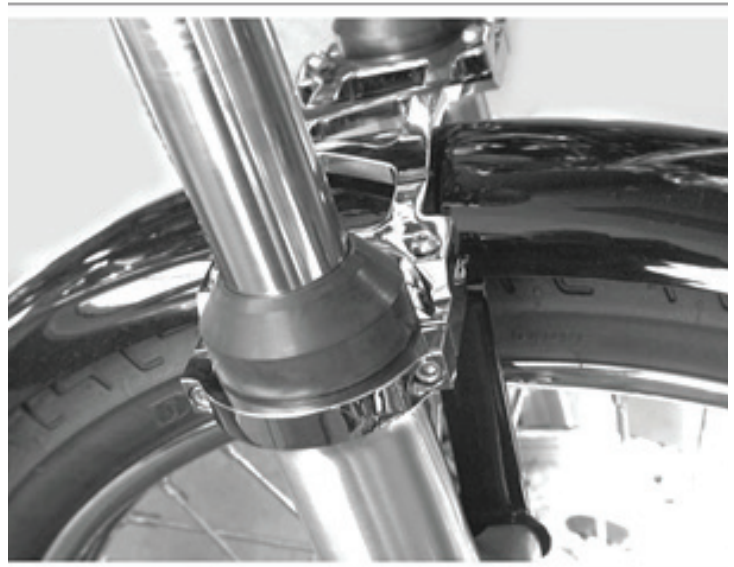
Figure 2. Installing Fork Brace Clamp Halves