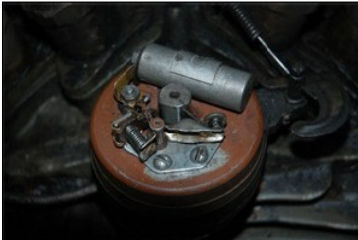
1936-1946 Ignition Base

Kit 36-47 fits Harley-Davidson models: 45" WL WLA WLC ( 1938-1947); 74&80 Knuckle and Flathead.