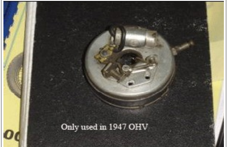
1947 all models

Kit 48-63 fits Harley-Davidson models: OHV 1948-1963 ( single point systems only! ) and most after market timing base.