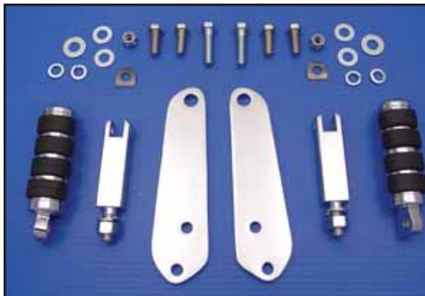
FXD Hiway Bar Kit with pegs fits 1991-up VT No. 27-0571