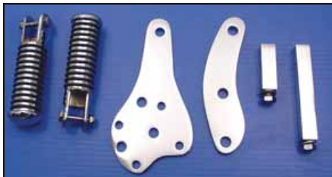
Hi-way Bar Kits include chrome mount plates, peg extensions bars, and O-ring peg set. Fits 1936-84 BT-FX-FXE. VT No. 27-0607