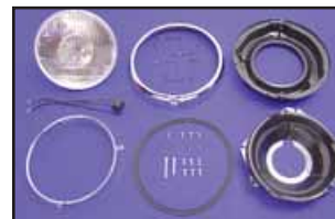
Headlamp Internal Kit. VT No. 33-0204

Tail lamps/Headlamps listed for show or decorative use only, not D.O.T. approved.