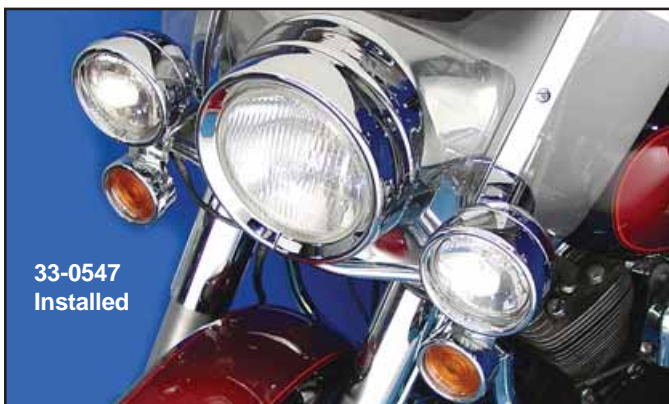
Frenched Headlamp Ring fits 83-up models VT No. 33-0547

Tail lamps/Headlamps listed for show or decorative use only, not D.O.T. approved.