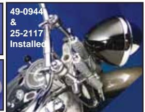
49-0944 & 25-2117 Installed