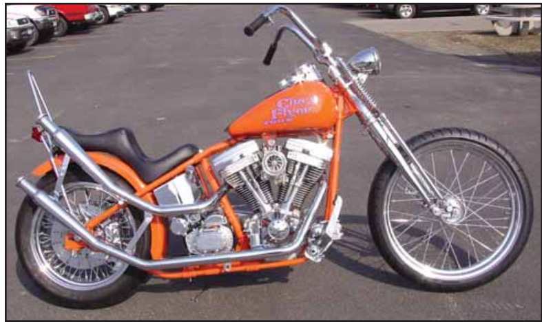
Cincy Flyer from the 2008 show, built with the 51-1957 frame.