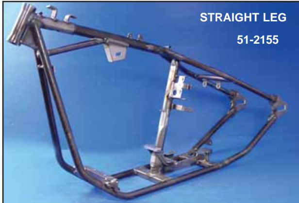
STRAIGHT LEG 51-2155