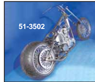
VT No. 51-3502

300 RSD Chopper Frame by Wyatt Gatling features full rigid styling with single or double tube motor carriage. Frame will accept round oil tank and up to 4" extended gas tanks. Neck is drilled for internal stop kit. Motor and transmission are in the stock position and no offset is required when using the right side drive transmission. 1" axle included. Both styles include Billet front motor mount. The 51-3502 300 Series features 1 3/8" tubing with 1 1/2" backbone. 51-3502 features 4" stretch in backbone and 6" in downtubes.