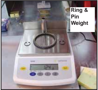
Ring & Pin Weight