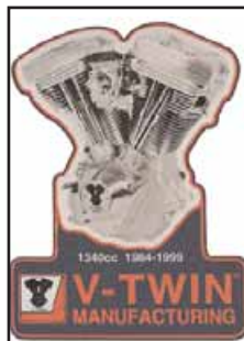
48-0030 1340 cc