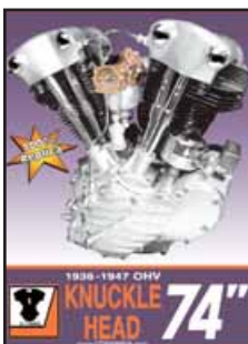
48-0470 Knuckle Head