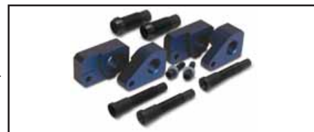
Jims Powertrain Alignment Tool aligns powertrain to proper position safely and easily on most touring models. Performing alignment service must be done when engine, transmission or swingarm has been repaired or removed. This tool helps to provide the accurate alignment necessary for handling safety and performance. For 1993-97 FLHT; FLHR; FLHX & FLTR. VT No. 16-1365