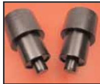
Swing Arm Bearing Installer Tool will install both right and left swing arm bearings squarely on their bores to the installed depth on 2002-up FLT models. Replaces 45327. VT No. 16-1058