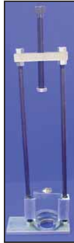
Shock Absorber Tool. Replaces 97010-52A to simplify shock absorber disassembly or assembly by holding spring in compression while disassembling parts. Includes 97019-52A block.