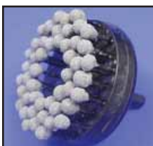
Flex Hone for Rotor designed to produce a swirl or cross hatch pattern with a non-directional finish which reduces friction induced braking noise: medium grit. Designed for low speed operation using a 3/8" drill. Available for Master Cylinder Bore.