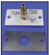
Front Low Pressure Master Cylinder Bleeder Covers will allow one person to bleed brake lines or to check system for leaks and can drain the entire system to replace brake fluid.