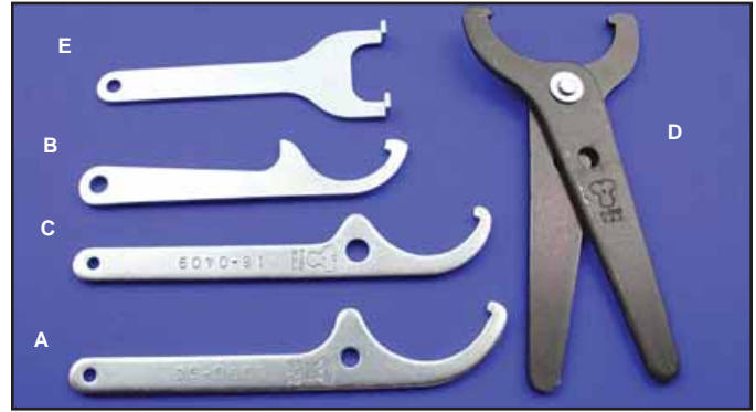
Shock Tool Set is a five piece set of each of the numbers listed below.