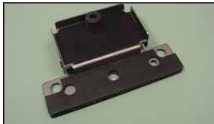
Brake Caliper Piston Remover Tool to aid in removal of piston from 2000-up front and rear caliper assembly. Replaces 43293A. VT No. 16-0541