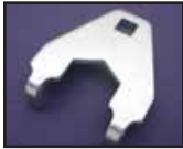
1989-up ST Shock Tool for use with 3/8" ratchet drive. VT No. 16-0917