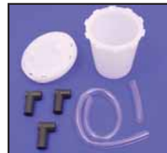
One Man Brake Bleeder includes tubing and canister and complete instructions. VT No. 16-1784