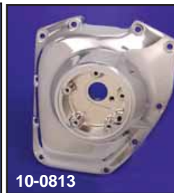
Chrome Gear Cover for all TC-88 Big Twins models.