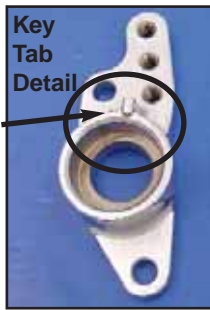
Key Tab Detail

51-0992 will retro fit 1982-02 to accept foot pegs and foot board mounts on the right left side.