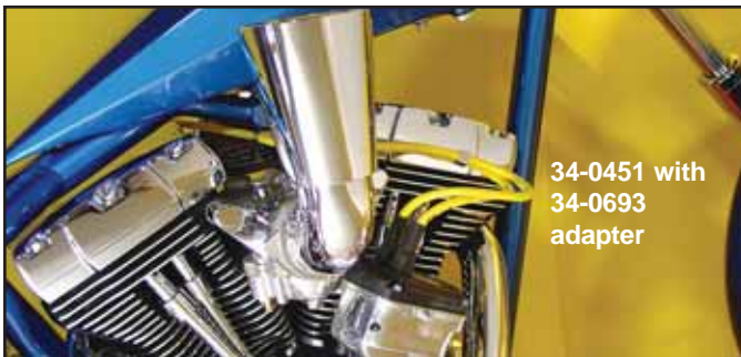
34-0451 with 34-0693 adapter