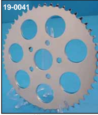
1973-84 Big Twin, 1979-81 XL

Rear Sprockets. Replace OEM 41470-73. Used on all 1973-86 FX, FXE, FXEF, FXWG, FXST, FL & FLH, 1979-81 Classic, cast or wire wheel. Dish type sprocket with 9.8 mm offset.