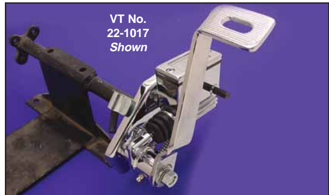
VT No. 22-1017 Shown

Original Forward Brake Controls assemblies will equip all Big Twins with hydraulic brakes and powered by either Evolution or 1970-99 Shovel engines. Available in either Wagner or Kelsey Hayes styles, with or without master cylinders. Footboards can be fitted to our Wagner style kits VT No. 22-0500, 22-0505 or 22-0506. Wagner styles use 41761-73 master cylinder, or Kelsey Hayes type 41576-79A, for those wishing to utilize their existing master cylinder. Complete assemblies include detailed instructions and diagram for installation. Display packaged.