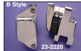
B Style 23-2220

Dual Disc Front Disc Calipers includes body, piston, seals and all related assembly hardware. Dual type fits 1977-83 FX-FXWG.