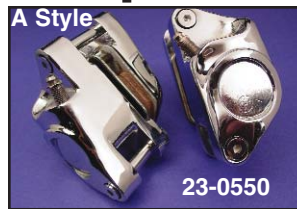
A Style 23-0550

1977-83 Chrome Dual Disc Caliper and Rotor Set includes 2 chrome calipers and 2 drilled rotors.