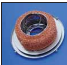
VT No. 34-0580

6" Air Cleaner Base includes copper mesh.