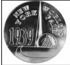
Logo Detail for NYWF