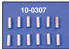
All Rollers by TORRINGTON®