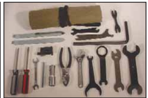
VT No. 16-0841

Side Valve Tool Kits includes canvas tool roll.