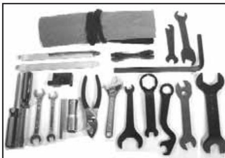
VT No. 16-0840