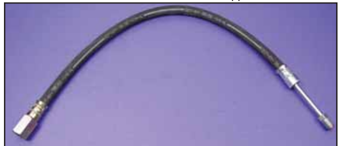
Rear Brake Lines for Sportster, tube is chrome STEEL from master cylinder to TEE, rear hose is rubber with chrome STEEL end from TEE to rear caliper.