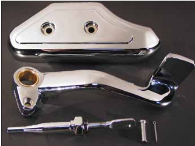
Chrome Pedal and Master Cylinder Cover Kit includes pedal, cover, plunger and mount hardware. Fits 1982-2003 VT No. 23-0672