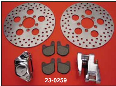
1977-83 Chrome Dual Disc Caliper and Rotor Set includes (2) chrome calipers and (2) 10" drilled rotors.