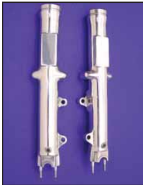
Chrome Lower Slider Set Only fits 1977-82 dual disc 35mm forks. VT No. 24-0541