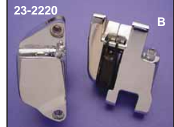
Dual Disc Front Disc Calipers includes body, piston, seals. Dual type fits 1977-83 FX-FXWG with 10" brake discs. Order mounting hardware separately.