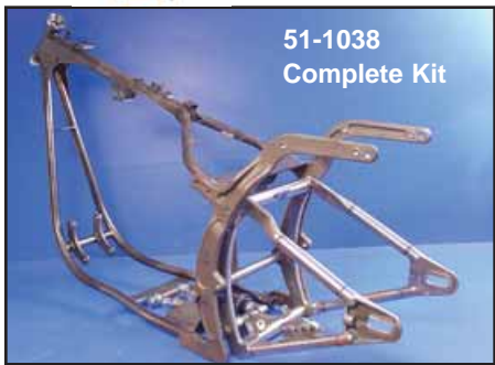
51-1038 Complete Kit