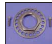
VT No. 20-0214

Mega Nut will secure pulley nuts on belt drive models by allowing drilling and tapping in additional locations.