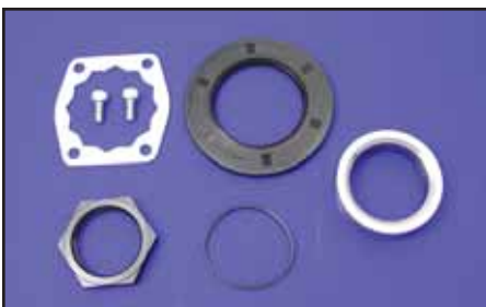
VT No. 20-0215

Big Twin Front Pulley Spacer Kit allows use of 1994-06 front pulley on 1984-93 models.