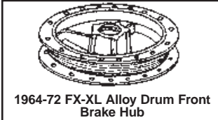
1964-72 FX-XL Alloy Drum Front Brake Hub