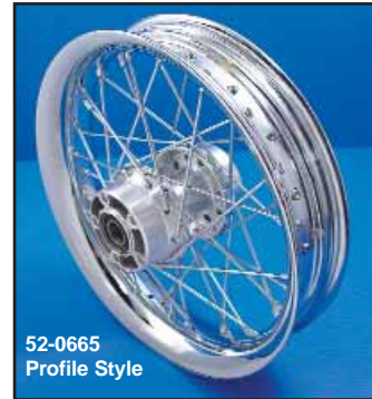
52-0665 Profile Style