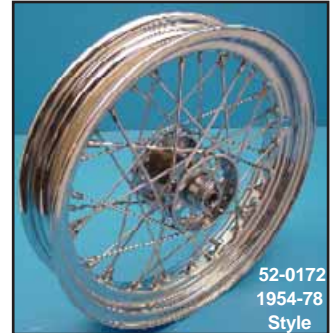
52-0172 1954-78 Style