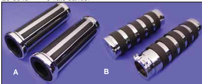
Chrome V-Tech Handlebar Grips. Type B features flat O-Rings for a firm grip. Type A is a rubber rail design set in a chrome die cast grip.