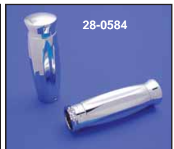
Chrome Billet Throttle Handlebar Grip Set for single or dual cable use.