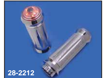
Billet Handlebar Grip Sets feature 4 position LED end lights.