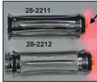
5 LED's Powered by 3 small batteries the end caps light up when pressed. There are 3 options: