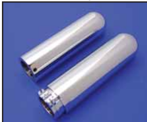
Fat Billet Grips match O.D. of large bars for symmetry. Both have ID for fit ends and accept single or dual throttle cable.