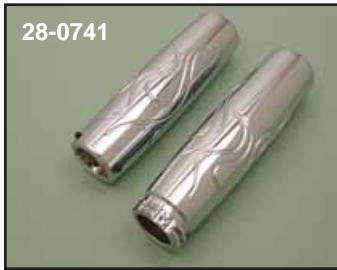
Flame Billet Handlebar Grip Set for single or dual throttle application.