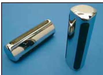
Chrome Delta Handlebar Grip Set feature a 3 point eccentric form with rubber cushion inserts.