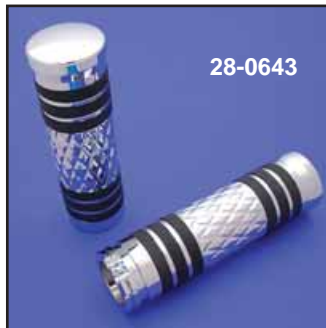
Billet Handlebar Grip Set with multi-band.