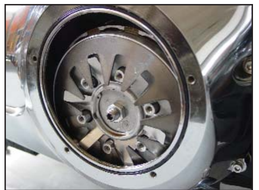
4. Place the spider inside the clutch spring with the fingers pointing out as shown. The spider can be manipulated through the slots in the diaphragm spring without removal.

7. The VPC comes with a replacement O ring in the kit for the derby cover. Some late-model big twins use a full circle gasket. The full circle gasket center must be cut to allow for clearance as shown.