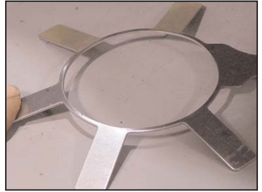
3. The spider that comes with the kit as a flat piece of steel needs to have its fingers or tangs bent a little to conform with the curve of the stock diaphragm spring.