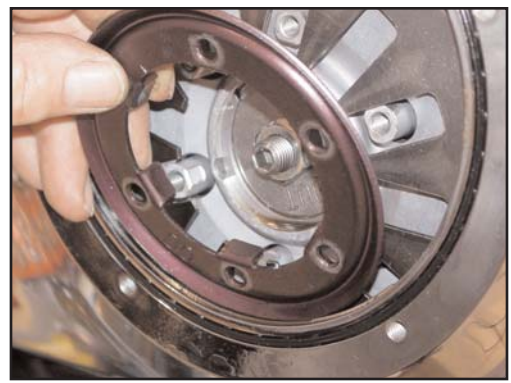
2. The spring plate is now free to be removed from the clutch. NOTE: If replacing the diaphragm clutch it will be necessary to remove the primary cover. Refer to the service manual on primary cover removal.