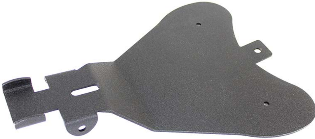
31-1760 Solo Seat Mount Pan

The 1986-03 XL uses the lower bracket to connect to the seat. For these years removing the front tab may be the only modification necessary if the seat does not require new holes to be drilled for fitment.