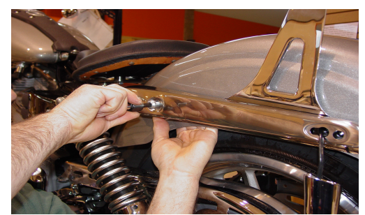
Re install the turn signal and fender hardware.