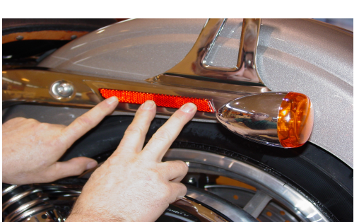
Install the reflector, using the provided tape.