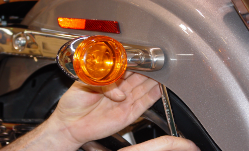
Remove the OEM turn signal assembly by removing bolt from under the fender