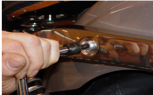
Remove the front fender strut bolt bolt.