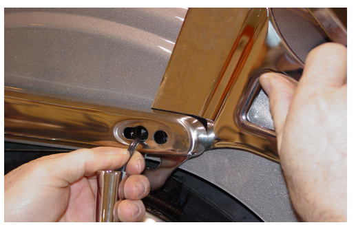
Align the side plated slot over the turn signal wire and re install the bolts in the turn signal assembly and front fender strut.